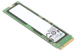
2TB Performance PCIe Gen4 NVMe OPAL2 M.2 2280 SSD